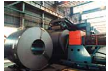
Coil magazine decoiling

The Hall Longmore 30 ton/ 2,5 m OD coil magazine and decoiling station for constant strip feeding, is recognised as one of the most modern in the world.