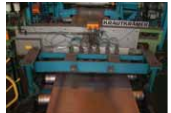
Steel strip lamination inspection

The Linsinger Edge Milling equipment has the capability of precision milling high-grade steel up to X70. It is possible to edge mill a maximum width of 15 mm/side at a speed of 19 m/minute at a wall thickness of 12,7mm.