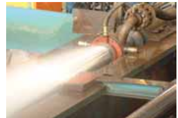
Hydrostatic testing and ultrasonic inspection

This process qualifies pipe integrity with testing pressures of up to 300 bar and six ultrasonic probes with full coupling control for final weld inspection. Pipe ends are manually inspected ultrasonically when required.