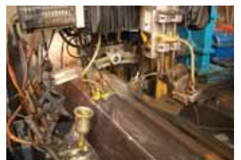
In-line Ultrasonic Systems

The ultrasonic systems designed by Krautkrämer monitor the weld integrity and measure weld bead geometry after internal and external scarfing. Mill operators therefore maintain consistent quality at the most critical zone in the pipe: the weld seam.